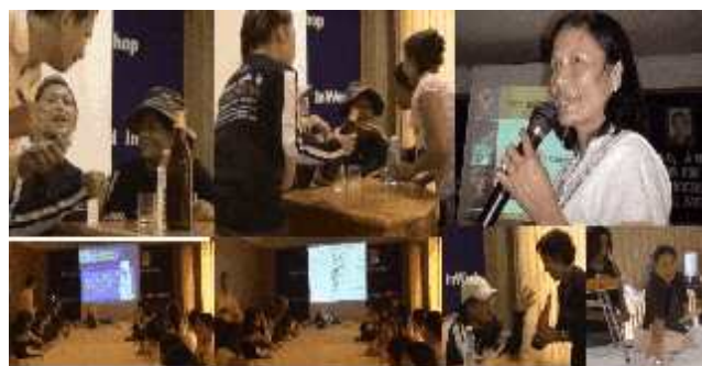
SiRCHESI and CARE Alcohol/AIDS Awareness Workshop, Aug. 5, 2005. Staff and beer-promoters role-playing and resisting, lectures, and pamphlets

SiRCHESI estimated that $150,000 was needed for each major international beer producer to eliminate workplace health/safety risks for 200 beer promoters annually . Each sells an estimated $13,000-$46,000 annually, but receives re-muneration of $660; offering the women a salary of $110 monthly, equivalent to 7.5% of the sale price of the beer, would produce a “fair trade” deal with a “living wage” – with income sufficient to feed their families and eliminate the need for any second job creating risks. The $150,000 would also cover the costs of ARVT/HAART medications, instead of leaving this up to the Global Fund and NGOs to cover.