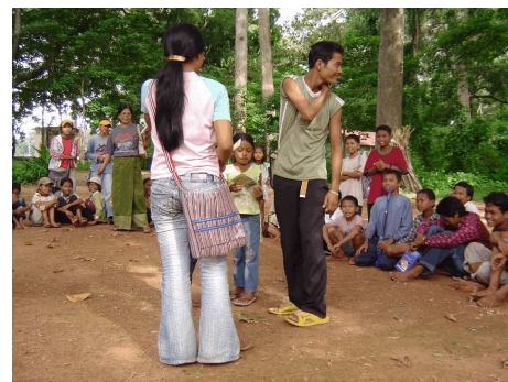
Young vendors aged 9-22, perform role- playing exercises with SiRCHESI staff, at Angkor Wat.

Are we having any effect? In 2005 and 2006, unofficial (VCCT) statistics indicated reduced HIV prevalence for married pregnant women, sex workers and beer-sellers. Despite these optimistic indicators, we continue our prevention activities in this constantly expanding community, alongside other government agencies' and NGOs' activities (ARVT, home-based care, stigma reduction, counseling, etc).